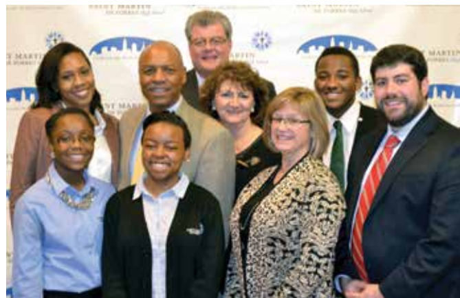
Dominion employees and Saint Martin students at this year's Partner Appreciation Luncheon.